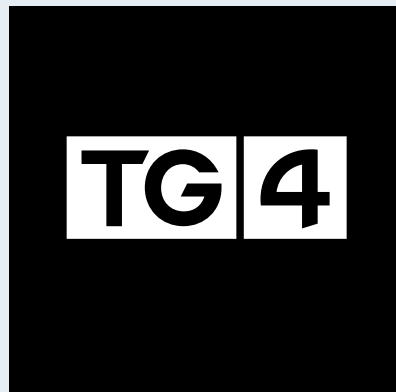
* Úsáid an logo seo sa chás eisceachtúil go bhfuil an cúlra ró-dhorcha don logo dubh. * Use this logo when the background is too dark for the main logo.