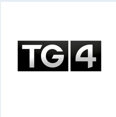
Príomh logo: Úsáid an logo seo i ngach cás* Main logo: Use this logo in every case*