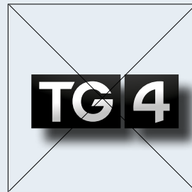
Ná bíodh cúiscáil ar an logo Don't use a dropshadow