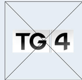
Ná úsáid an lógo aisiompaithe Don't use logo in reverse