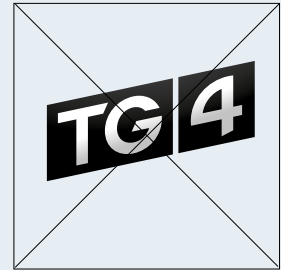
Ná déan: cruth an logo a athrú Do not skew