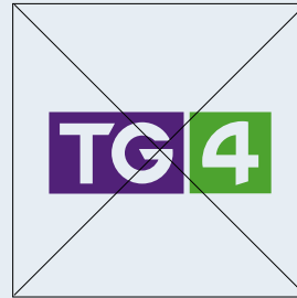
Ná úsáid logo daite Don't use coloured logo