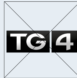
Ná déan síneadh ar an logo Don't stretch the logo