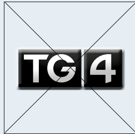
Ná húsáid "Bevel/Emboss" Don't use "Bevel/Emboss"