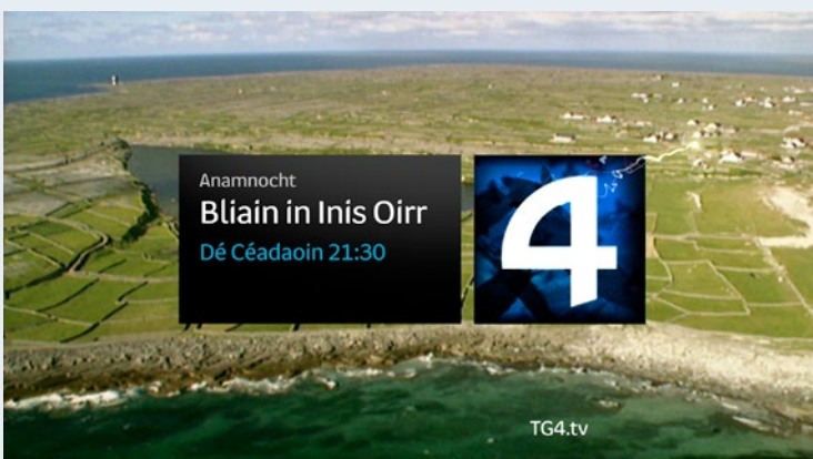
End of Promo

TG4 will use duration of programme credits to give information on the schedule. Here is an example of the style of information given over credits.