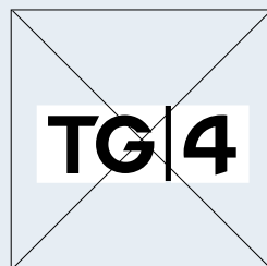
Ná cuir bosca dubh taobh thiar dhó Don't put a black box behind logo