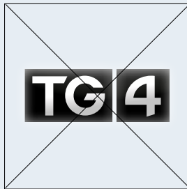
Ná húsáid "Glow" Don't use "Glow"