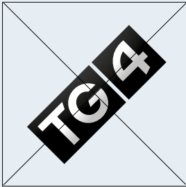
Treo a athrú Change Orientation